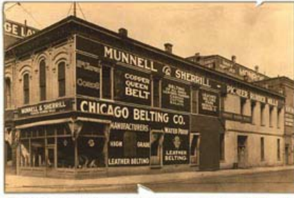
The 1915 location of Chicago Belting Co. that became Munnell & Sherrill